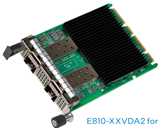
E810-XXVDA2 for OCP 3.0

Intel® Ethernet Optics, and specification-compliant Active Optical Cables and Direct Attach Cables, can support multiple configurations.